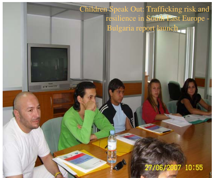
Children Speak Out: Trafficking risk and resilience in South East Europe - Bulgaria report launch

AAF and PBF held the launch of Bulgaria Research Report in a round table event with the participation government officials (including police, public prosecutor's office, ministry of education and state agency for child protection), NGO working in the area of child protection, Roma women's organization representatives and children from Resource Centre in Kyustendil.