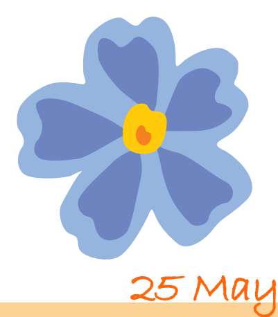
International Missing Children's Day

PARTNERS: Radda Barnen (Save the Children Sweden), Ministry of Education, Research and Innovation, Ministry of Interior and Administration Reform, United Way, National Agency Against Trafficking in Persons, Saatchi & Saatchi, Romanian Television, Radio Romania, Diverta, Hollywood Multiplex.